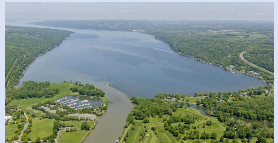
10 best things to do in Ithaca, NY